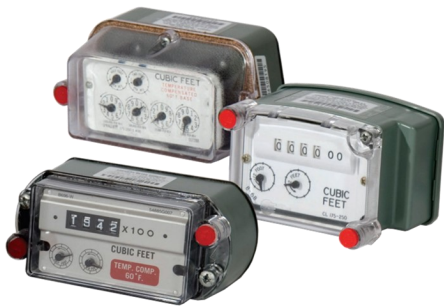
NXCM Cellular Module